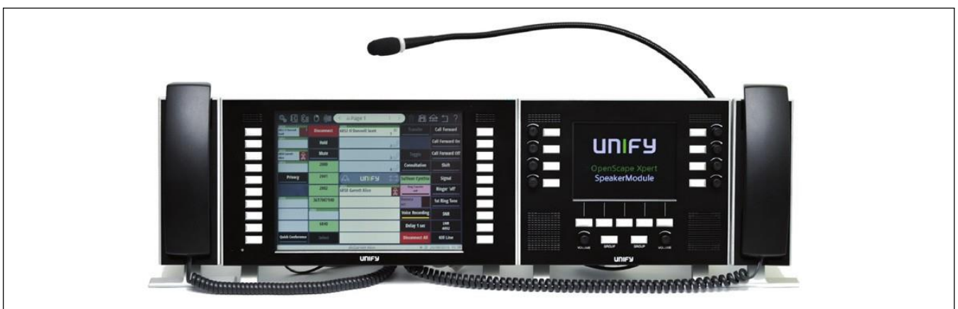
OpenScape Xpert 6010p V1 terminal

To reduce the number of moving parts and increase mean time between failures/replacement, the OpenStage Xpert device uses a compact flash card and is fanless. In addition, all of the components in the solution are compatible with VMware and can be doubled-up for redundancy and high availability.